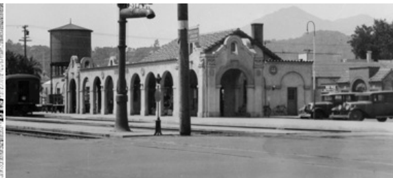
B6-2: Historic 1935 image facing southwest *6