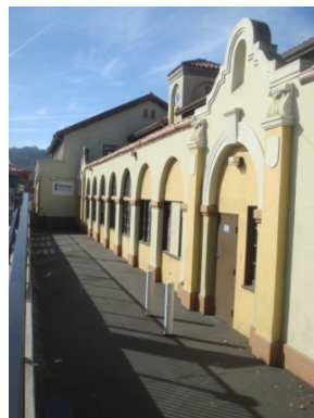
P3a-8: SMP-3, 7-arch Arcade to SMP-4 Northeast vestibule camera looking southwest (LHS 10/2018)