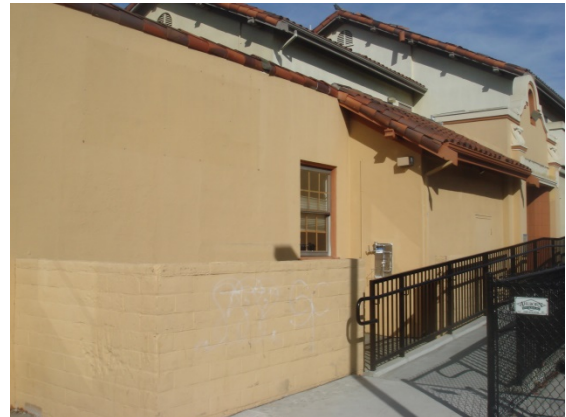
P3a-13: Southwest corner showing 1981 trash enclosure and utility room additions (LHS 10/2018)