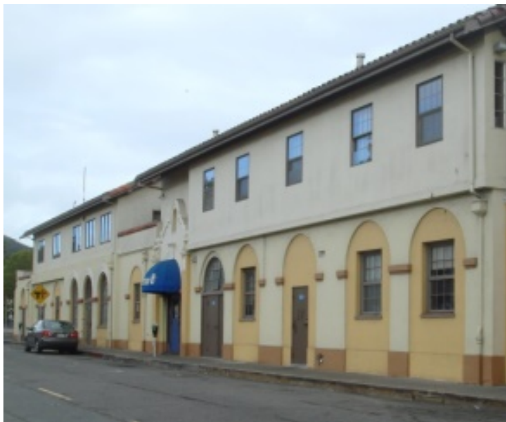
P3a-2: Tamalpais Avenue with baggage wing on the right, SMP-1 in center and passenger waiting room to the left – looking northeasterly (Leslie H Simons [LHS] 10/2015)