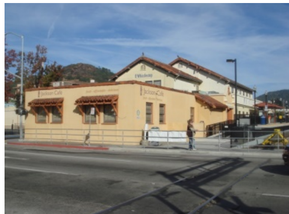
P3a-15: south end – camera facing Northwesterly (LHS 10/2015)