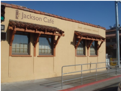
P3a-16: South end sunshades and knee braces (LHS 11/2019)

Property Name: Whistlestop – Northwestern Pacific Railroad Depot Page 13 of 18