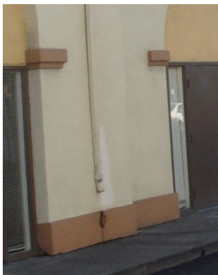
P3a-20: Condition - No connection between rainwater leader and curb outlet (LHS 11/2019)