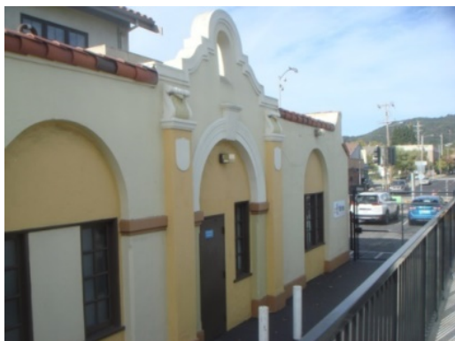
P3a-7: North east facing SMP with 1951 and 1987 additions. – Camera looking northwest (LHS 10/2018)