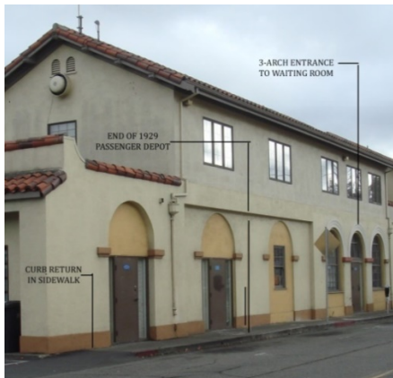
P3a-5: North end of west façade. Notes illustrate the original northwest corner of the 1929 passenger waiting room. Camera facing southeasterly (LHS 10/2015)

Property Name: Whistlestop – Northwestern Pacific Railroad Depot Page 11 of 18