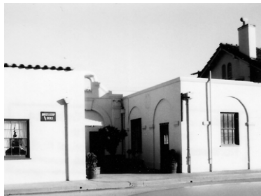
B6-4: Showing the station agent entrance and enclosed north vestibule c. 1974. Camera looking easterly *7