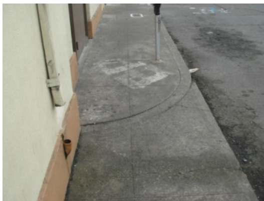
B6-5: Sidewalk Curb Return illustrating original pedestrian walkway and vehicle parking area as seen in B6-7 (LHS 10/2015)