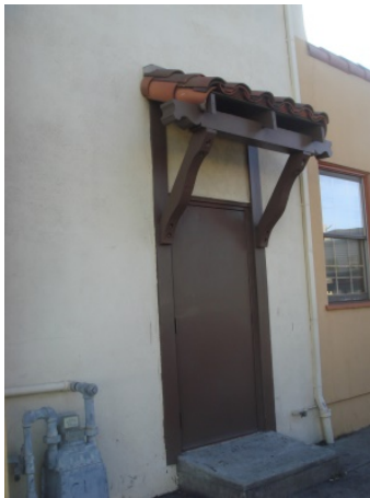
P3a-18: West face sunshade reflecting Mission Revival style by Whistlestop 1987 (LHS 10/2018)