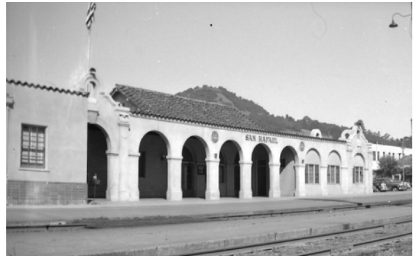
B6-8a: Arcade showing 3 enclosed arches - Prior to the 1951 north end office addition - camera looking northwest *10