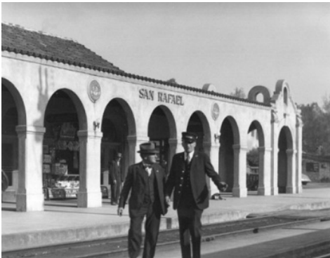
B6-8: Original open arcade in 1938, - camera facing northwesterly *9