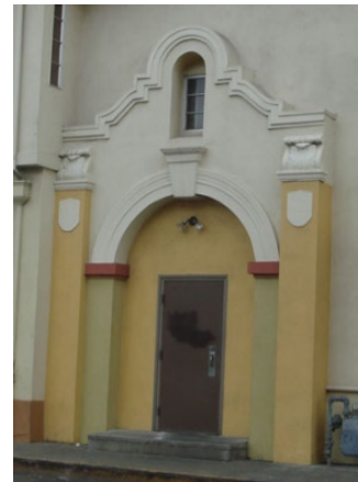
P3a-19: SMP-6 added with 1981 plans note window in bell (LHS 10/2015)