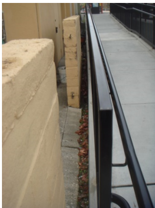
P3a-14: 7- inches remain between SMART ramp & trash enclosure gate (LHS 12/2018)