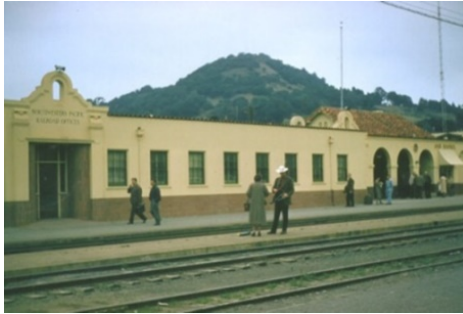
P3a-11: Railroad addition c.1950 Camera looking north east *3

Property Name: Whistlestop – Northwestern Pacific Railroad Depot Page 12 of 18