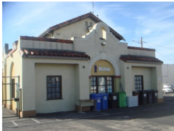
P3a-6: 1987 Whistlestop decorative north end addition facing Fourth Street. This is the only raised parapet arch without a door – Camera looking south (LHS 10/2018)