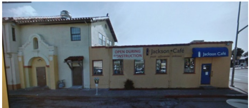
P3a-17: 70-foot, 1944 south end addition looking east