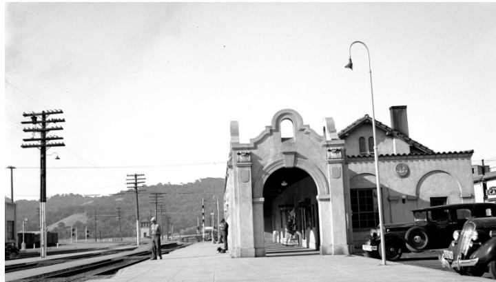
B6-7: 1935 image of vehicle parking and north end of depot – camera looking south *8

Property Name: Whistlestop – Northwestern Pacific Railroad Depot Page 15 of 18