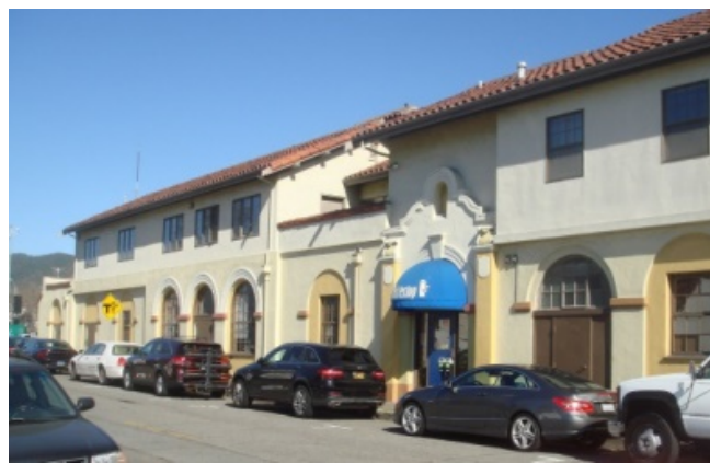
P3a-4a: – Similar view with 1980s second story additions (LHS 10/2015)