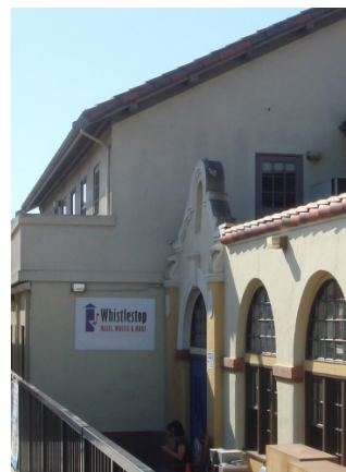
P3a-10: 2-story north facing wall with second level door (LHS 11/2019)