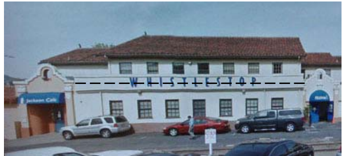
P3a-11a: Same wing with second level addition - camera looking straight west. *4 dashed line indicates top of 1944 addition