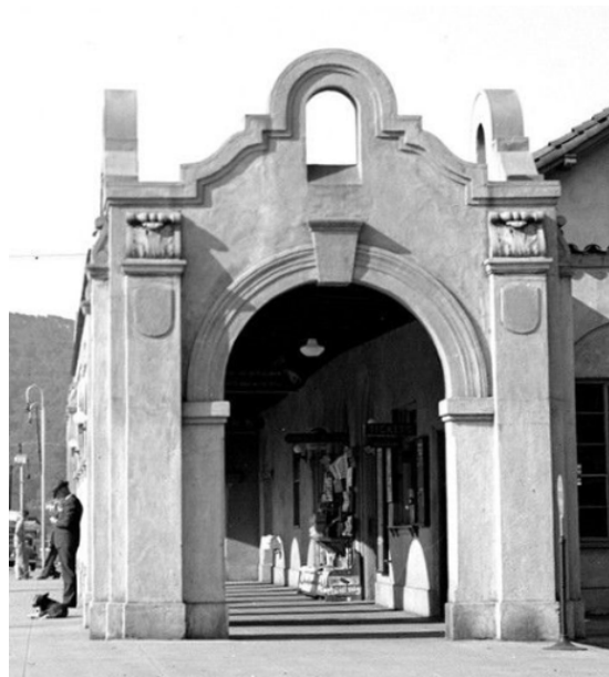
P3a-3: 1935 image of original open 3-sided raised shaped Mission parapet east side north-end vestibule - camera facing south * 1