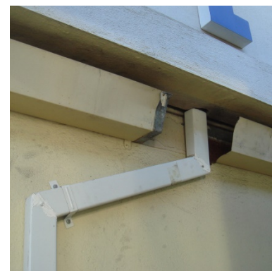
P3a-21: Condition - Upper to lower rain water leader connection (LHS 11/2019)