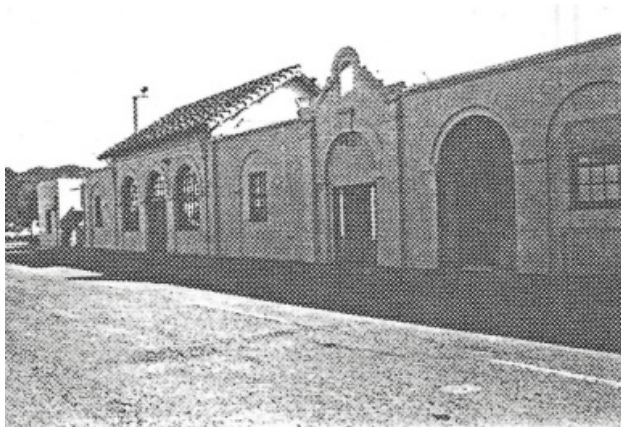
P3a-4: Showing original shaped Mission Parapet 1, raised gable over passenger waiting room and 1951 office addition. Photo from 1976 survey camera facing northeasterly * 2