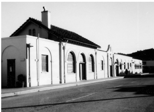
B6-3: Shown before the 1978 Whistlestop ground floor addition - camera looking southeast *7