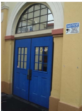
P3a-9: SMP-4 (LHS 9/2019)