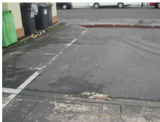
B6-6: Still extant curb for waiting vehicles shown in B6-7 (LHS 1/2019)